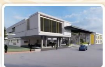
Veda International School