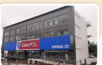
Vishal Mega Mart